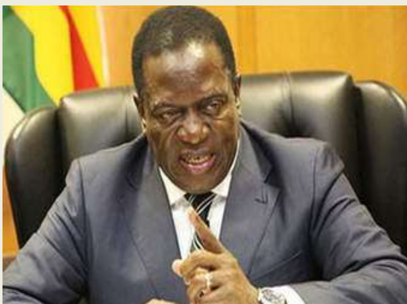
President Emmerson Mnangagwa

The First Respondent is further required in terms