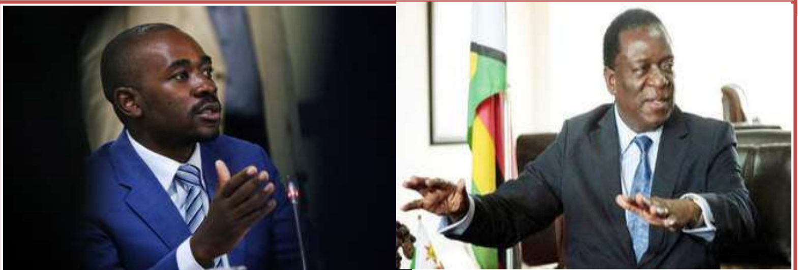
MDC Alliance President Nelson Chamisa (left) has been raising the legitimacy card accusing President Emmerson Mnangagwa (Right) of stealing the 2028 elections with assistance from the Zimbabwe Electoral Commission (ZEC). In response, President Mnangagwa has been sarcastically asking opposition political parties to calm down and watch while he steers the ship in the right direction.

HUMAN rights violations which include abductions, murder, arbitrary arrests and a general clampdown on opposition and civic society activists have largely alienated Zimbabwe from the international community.