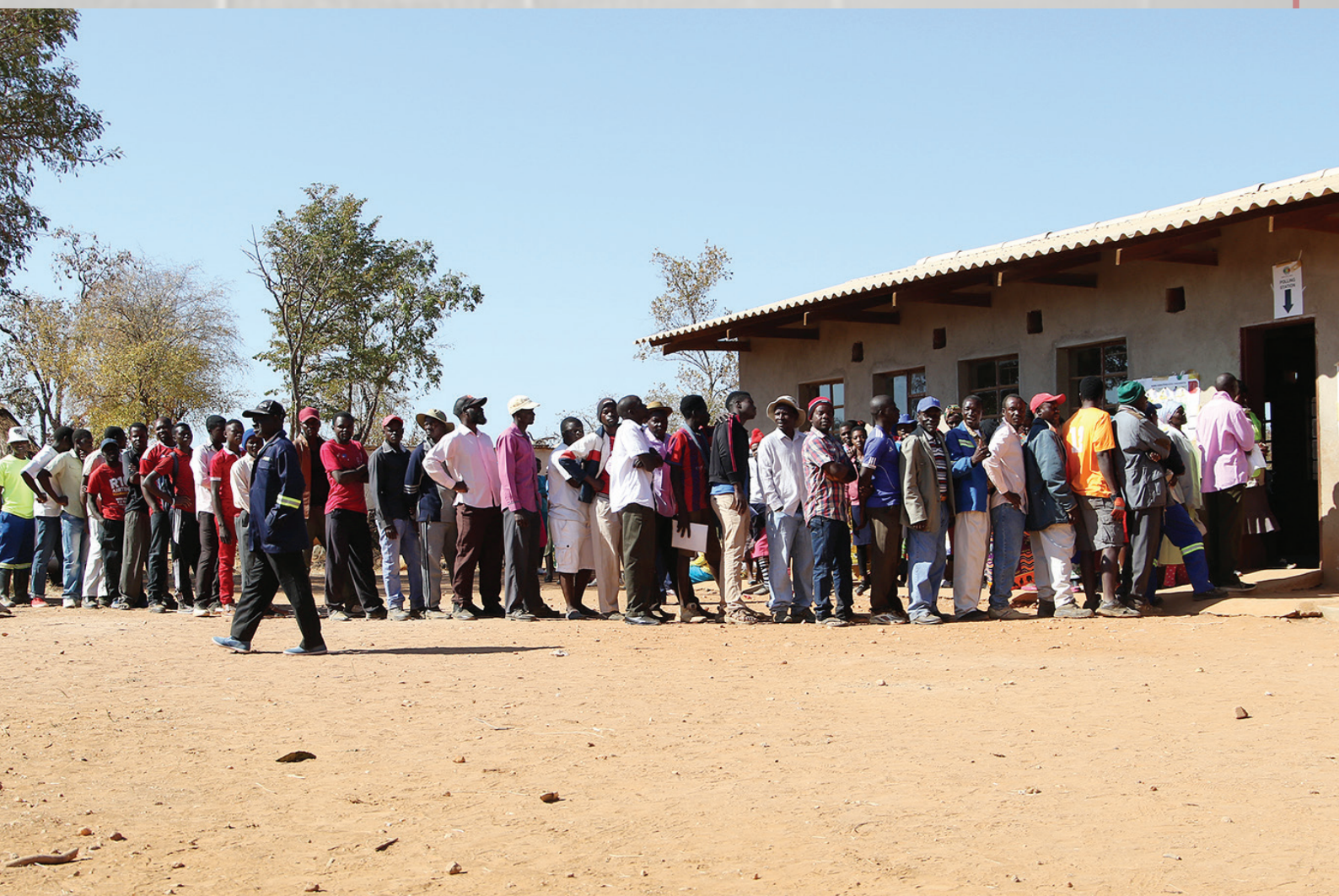
Voters queue to cast their ballots in Chakari in July 2017