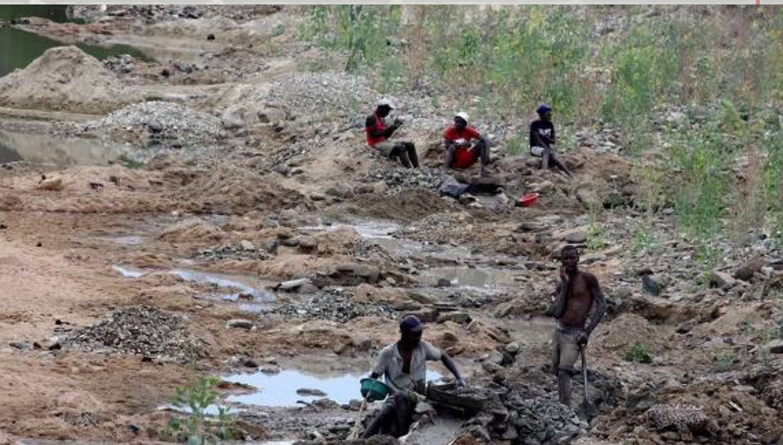
Illegal miners in Masvingo

"The miners are also excavating gold beneath the city water tanks situated in the hills. The miners also use poisonous chemicals like cyanide that can contaminate water."