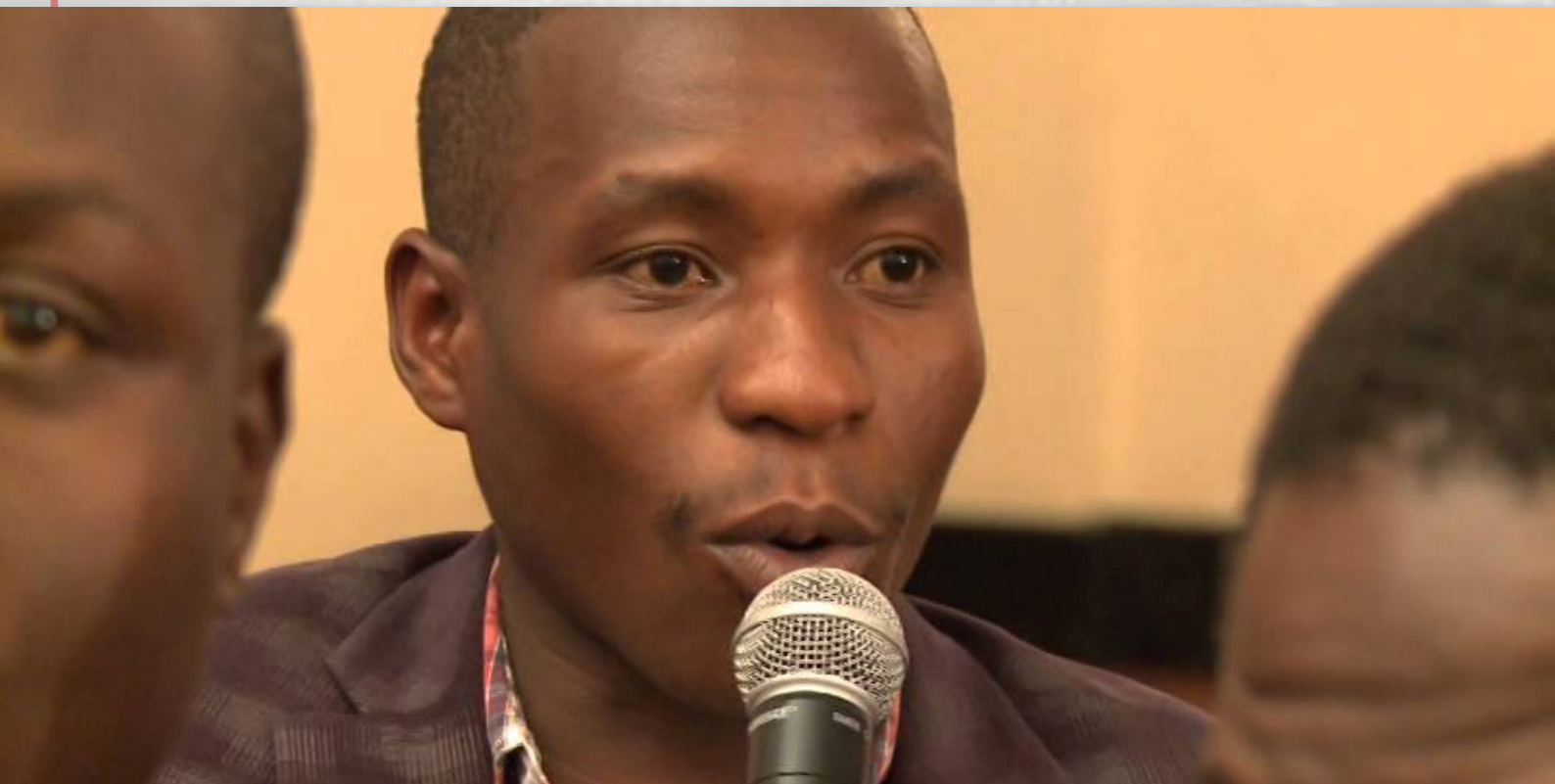
Pride Mukono

Mkono's case highlights the weaponisation of the Judiciary to persecute dissenting voices in Zimbabwe.