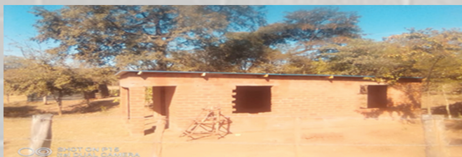
After COTRAD intervention